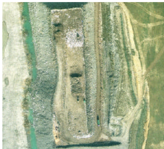
12.5 cm resolution aerial photography provides a detailed view of a landfill site

The data, flown at 1:5000 scale resulting in 12.5cm resolution digital ortho-bases, provided the council with a good level of detail for the Cambridgeshire region. Regular surveys help to ensure that the council's existing orthophoto database is kept accurate and up to date for monitoring activity change over time.