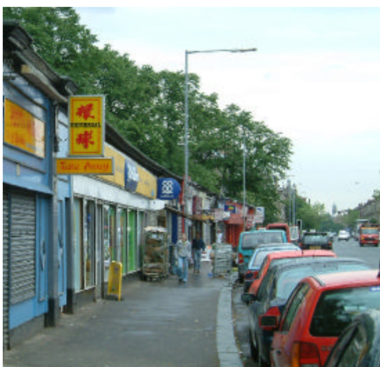
Street shows a widespread distribution of detritus

Cities Revealed Land Use™ database provides local authorities with immediate access to the BVPI land use categories, reducing survey implementation and delivery time.