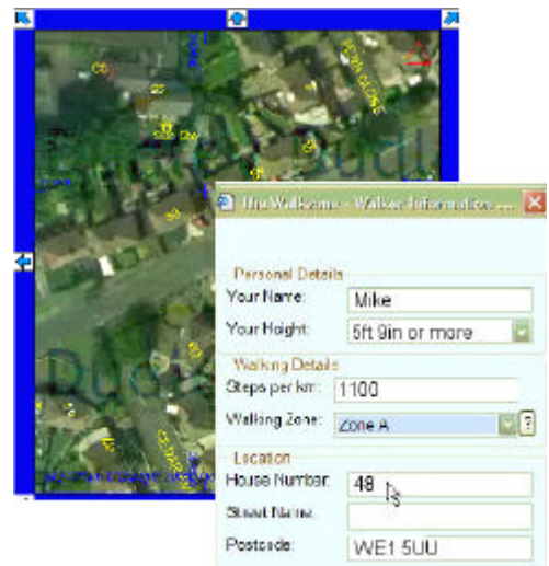
Approximate walking distance and time is calculated based on user information

What’s more, the Cities Revealed Internet Licence permits website users to print out their personalised route as and when they need it.