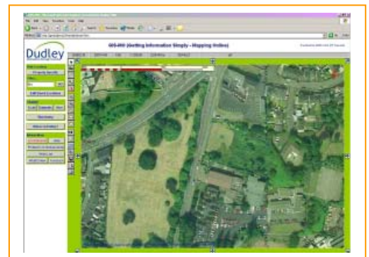
Community engagement in Dudley through their GIS

In the fight against global warming and as a means to prepare our communities for the inevitable changing climate geography is a key tool to communicate, inform and interact at the local level.