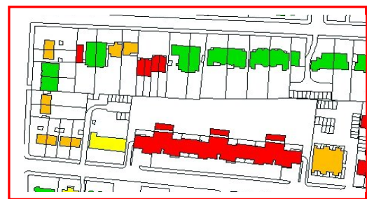
An example of thermal aerial mapping is above, with different colours for relative heat loss from buildings. Red and orange are high, yellow is average and green and blue is low.

The effectiveness of energy conservation campaigns can be measured with successive aerial thermal surveys.